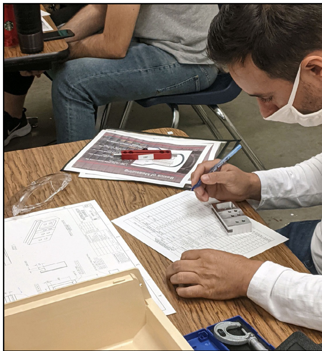
A student measures parts for mechanical inspection.

To maximize student options for progressing through the program quickly, CAJ's manufacturing instructor and SVMA consultants developed four distinct training modules that could be taken in any order: Cal/OSHA-10 online safety training, forklift on-site training, online Tooling-U manufacturing lessons, and a 40-hour paid internship with an SVMA employer partner (paid for City of Sacramento residents only).