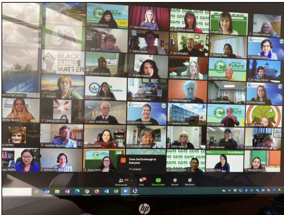
The California Council for Adult Education (CCAE) state conference—held virtually this year for the first time ever—took place during California Adult Education Week, April 19–23, 2021. Over 1,400 adult educators attended.

This year's conference was organized by the Northern Section of CCAE. In addition to CAERC staff and members being the lead conference organizers, we got plenty of help from our sibling-departments, OTAN and CAEP TAP, all under Adult Education Division at Sacramento County Office of Education. And special thanks for making the conference a success to our adult education colleagues from Amador USD, Elk Grove USD, San Juan USD, Sacramento City USD, and Stockton USD.