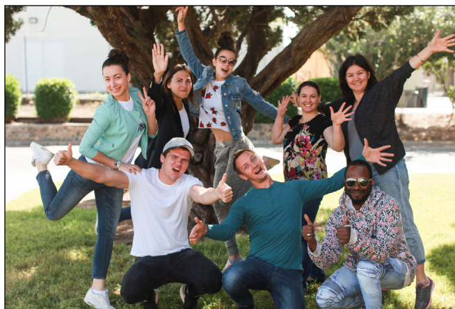
Learners in the Adult Secondary Education program at TRAS

CAERC Community, please share how your programs are finding innovative ways to link our adult learners as community members to the resources that help them move from underserved to middle class.