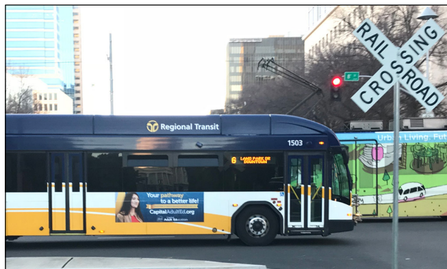
SacRT bus spotted featuring a CAERC advertisement!

Search "Capital Adult Education" or facebook.com/capitaladulthoodeducation