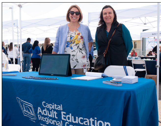
CAERC members at the 2018 Resource Fair organized by SCOE's Sacramento Community Based Coalition (SCBC) featuring programs and services beneficial for Adult Re-Entry Program participants