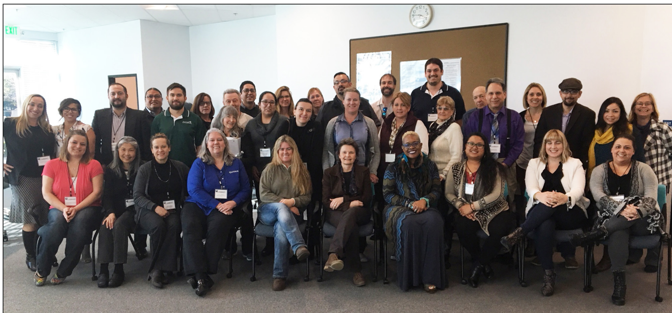
Attendees at the New World of Work 21st Century Employability Skills Training

SELF-AWARENESS LITERACY COMMUNICATION SOCIAL/DIVERSITY EMPATHY RESILIENCE MINDSET ADAPTABILITY ENTREPRENEURIAL ADAPTABILITY COLLABORATION