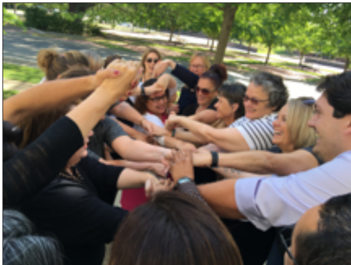
Working together as a team to untangle a human knot!